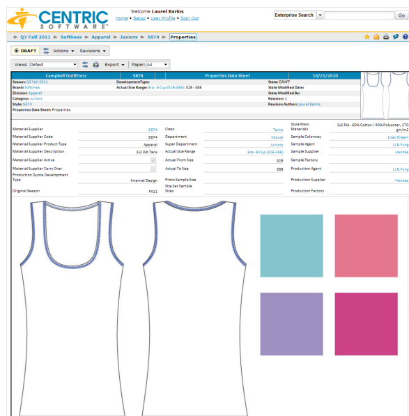
Fully capture bill of materials, drawings and materials in an easy-to-use interface.

Centric 8 PLM incorporates the domain expertise, processes and business practices that are common within the apparel and fast moving consumer goods industries, helping to speed rapid value delivery. Similarly, Centric 8 incorporates an intuitive, easy-to-use interface that users find approachable and understandable. User acceptance and adoption are critical to achieving rapid benefit and full system value. Finally, Product Specification—like all Centric 8 modules—delivers robust functionality on its own. But its real power is unlocked when it is combined with other Centric 8 modules, unleashing synergies that assure the benefits generated by Centric 8 expand beyond the department or workgroup to the entire extended enterprise.