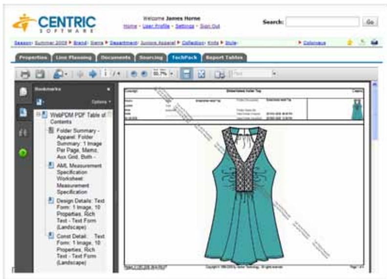
WEBPDM TECHPACK EXPOSED IN CENTRIC 8